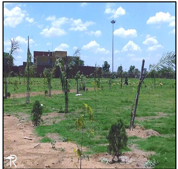
Photo no. 2 Colony plantation along the side of the roads and open spaces