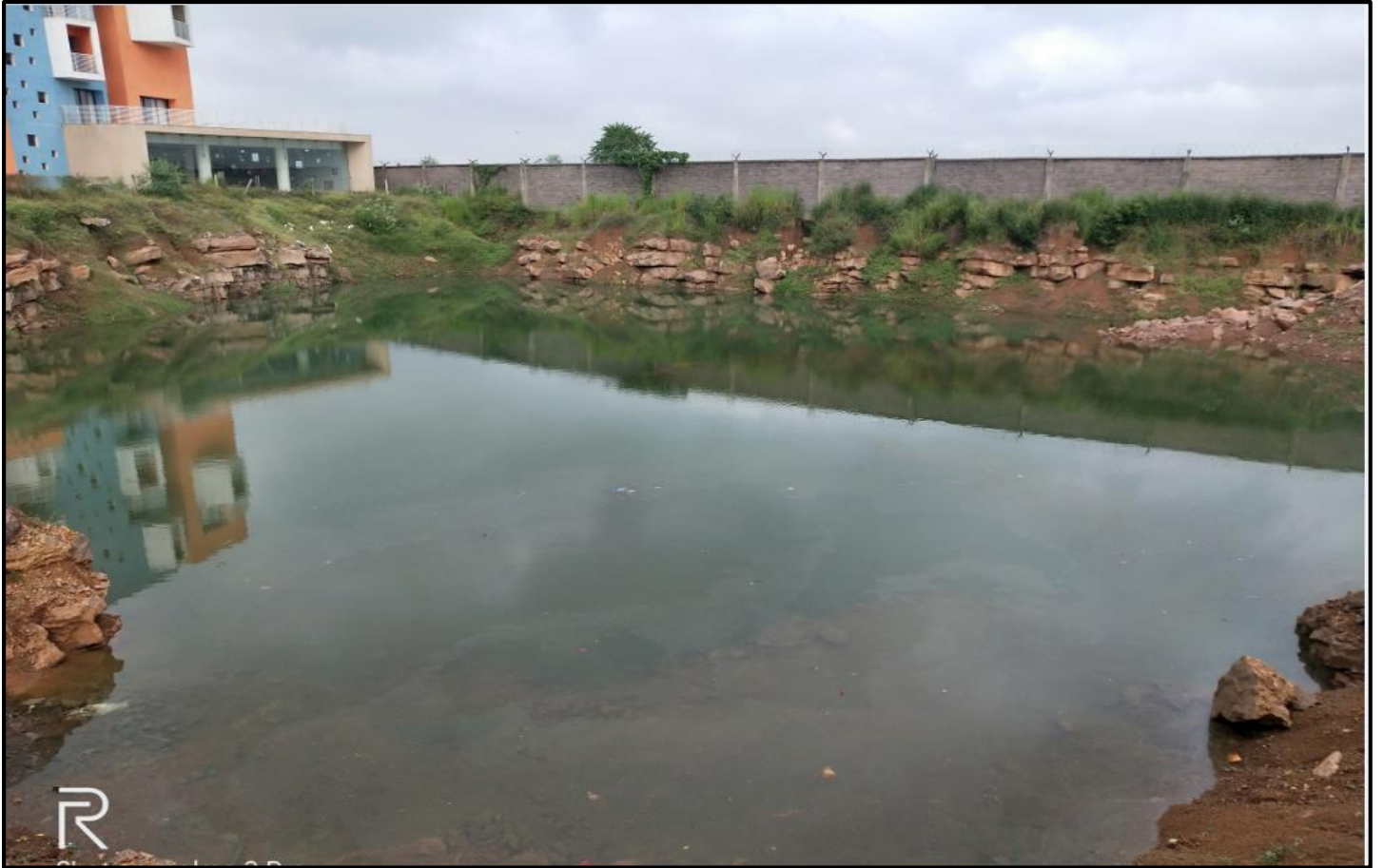
Photo no. - 3 Rain Water harvesting pond at Colony, Capacity - 20,000 KL