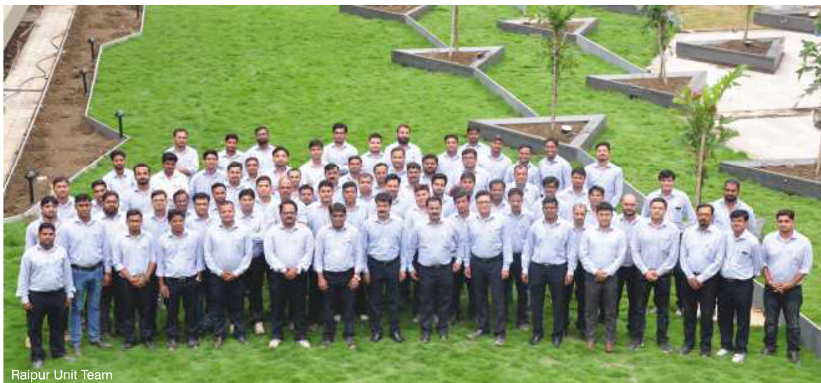
Raipur Unit Team

Enables in identifying new areas of intervention Improving report content for future reports