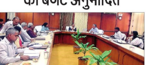
बॉम की बैठक में 179 करोड़ का बजट अनुमोदित