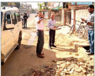
कार्य में लापरवाही पर तीन जमादारों को थमाए नोटिस