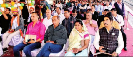
अजमेर स्टेशन पर सौदी स्टील अजमेर की पहचान-भेद

अजमेर स्टेशन पर सौदी स्टील अजमेर की पहचान-भेद देना है।