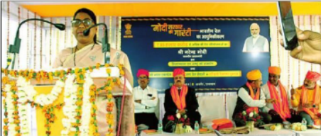
अजमेर स्टेशन पर सौदी स्टील अजमेर की पहचान-भेद

उद्योगों का विकास और उद्योगों को प्रोत्साहित करने के उद्देश्य से सौदी स्टील अजमेर को पहचान-भेद देना है।